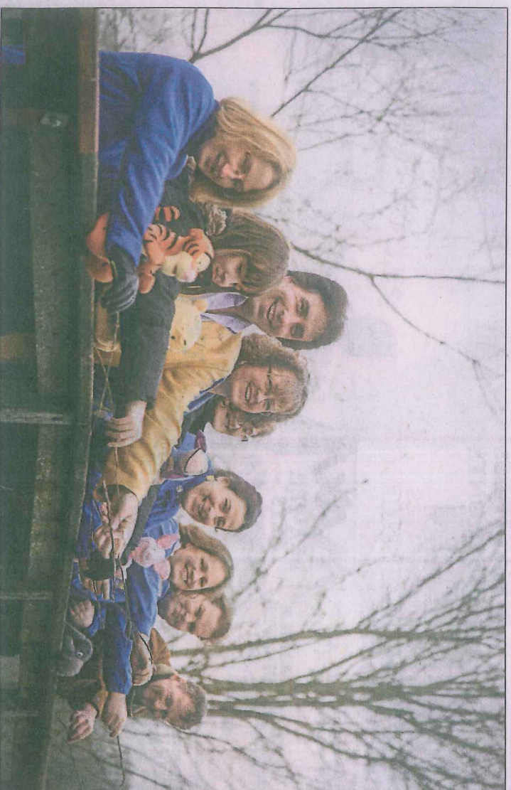
The World Pooh Sticks Championships has a new home at Langel Common and will be held in the summer for the first time when the Rotary Club of Oxford Spire puts on the event on Sunday, June 7

"We are delighted to be supporting the new home for the world championships." Due to a high level of boat traffic during the summer on the Thames, the Environment Agency only allowed the