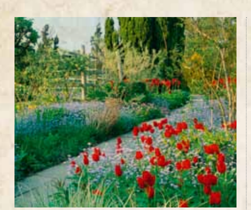
Most beautiful garden Great Dixter, East Sussex

Great country gardens offer another perspective on our landscapes and we asked Gardens Illustrated magazine editor Juliet Roberts to compile a shortlist. Great Dixter is celebrated for its flamboyant successional planting, ably maintained by Head Gardener Fergus Garrett.