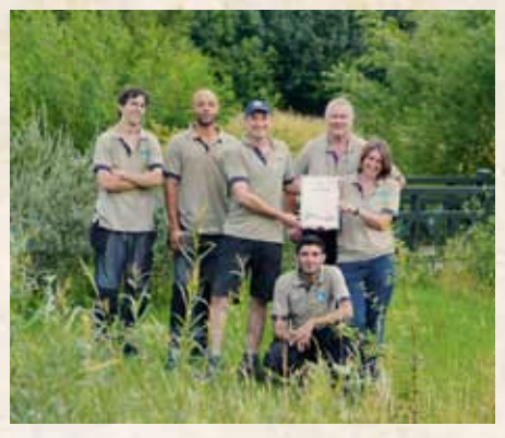
Favourite nature reserve London Wetland Centre (WWT)

2nd place - Mapperton, Dorset 3rd place - Audley End Kitchen Garden, Fssey