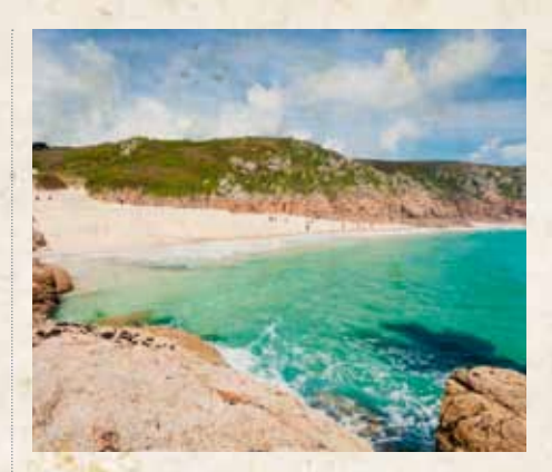
Favourite British holiday location Cornwall

2nd place – Attenborough Nature Reserve, Nottinghamshire 3rd place - Farne Islands (National Trust), Northumberland